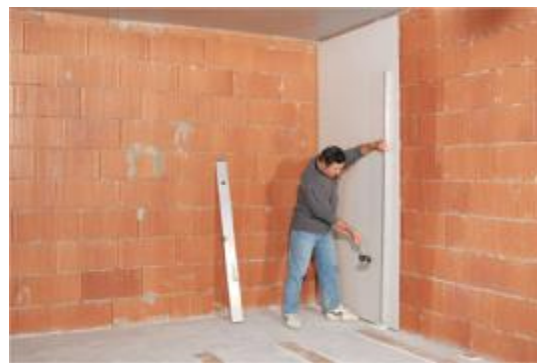
Fig. 1 Application of adhesive to plasterboard [14] Fig. 2 Dry lining, straightening of plasterboard[15]

The most important advantage is effective compensate for any unevenness for a short time, in the required quality and at a reasonable cost. This method is called dot and dab. The fact that dry lining is lighter than its wet counterparts means that the finished construction is lighter and less moisture is introduced into the building structure. Dry lining of partitions also mean that property can be changed to suit the changing needs of a family more quickly [3]. According to [12] conservation of fuel and power are most governments buzzwords these days. Plasterboard also comes in many varieties which,